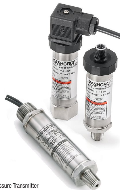
A4 Pressure Transmitter