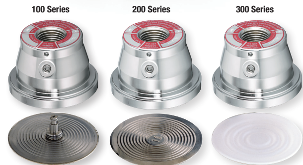
100 Series Diaphragm Threaded To Top Housing - flexible design