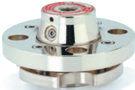
TYPE 403 SHOWN