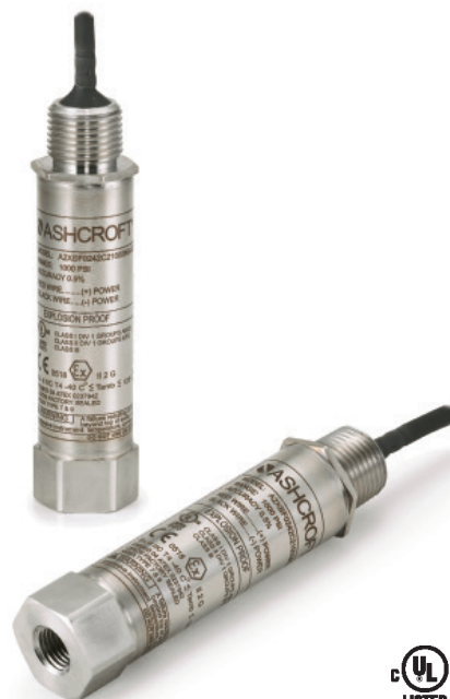
A2X Explosion/Flame Proof Pressure Transmitter