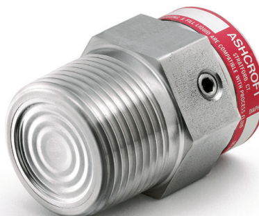
330 Threaded Seal