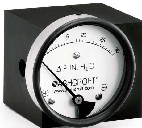
1133 3½", 4", 4½", 6" dial sizes