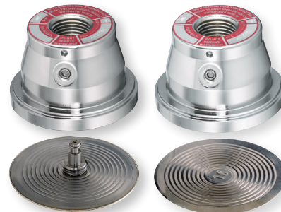
Diaphragm Threaded To Top Housing - flexible design