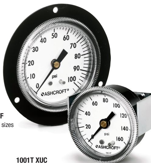
1001T XUC 1½", 2", 2½", 3½" dial sizes