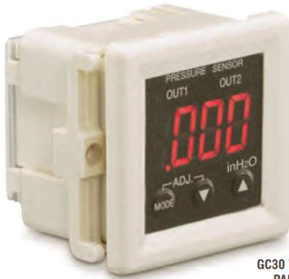
GC30 WITH INSTALLED PANEL ADAPTOR